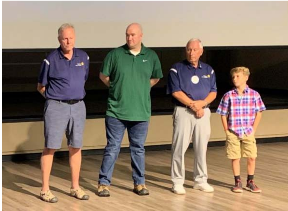
Rotary Club of Plymouth Broadcaster August 19, 2022